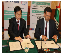
MOU with A-WEB