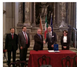
MOU with Venice Commission