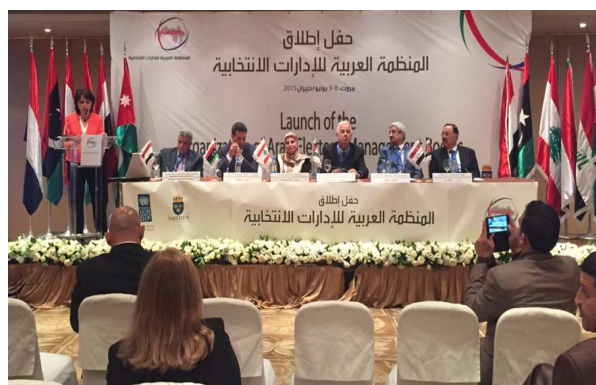
Launching Ceremony 2015