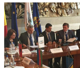
MOU with ACEEEO