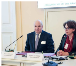
MOU with CEC Russia